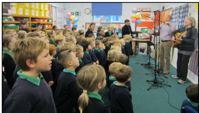
Above: The Upper Juniors classroom is turned into a recording studio