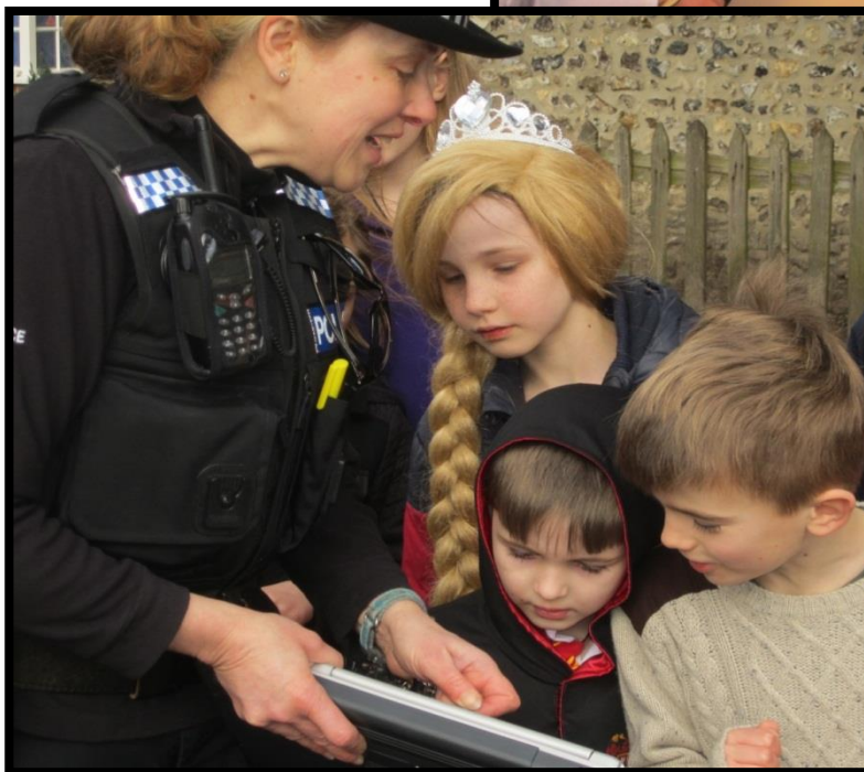
Left: Secrets of the trade. The UV pen reveals the 'invisible ink' postcode on the stolen laptop

LEWKNOR C of E PRIMARY SCHOOL HIGH STREET LEWKNOR OXFORDSHIRE OX49 5TH