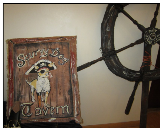
Above: Some fantastic pirate artwork.