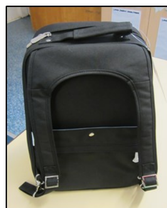
Above: the very snazzy commuter bag

LEWKNOR C of E PRIMARY SCHOOL HIGH STREET LEWKNOR OXFORDSHIRE OX49 5TH