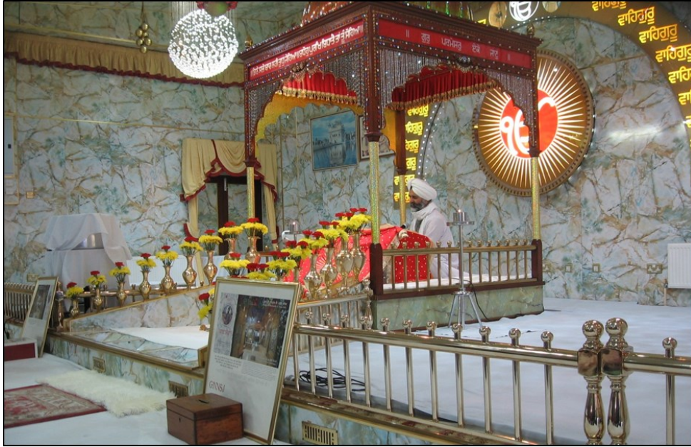
Top: Inside the prayer hall