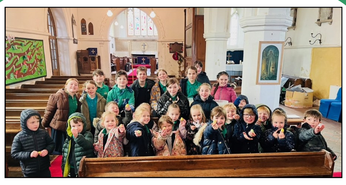
Above: the Year 6 children organised the Easter egg hunt in the church this year. Here they are pictured with the children from the Reception class