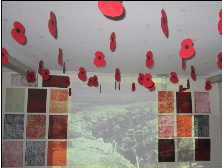
The reflection room is turned into Flanders Fields with artwork by the Upper Juniors.

In Flanders fields the poppies blow Between the crosses, row on row, That mark our place; and in the sky The larks, still bravely singing, fly Scarce heard amid the guns below John McCrea