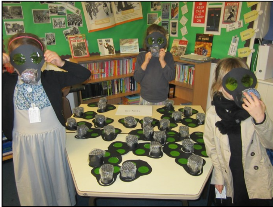
Left: Children made gas masks.

Some also imagined what it was like to be an evacuee and wrote diary excerpts.